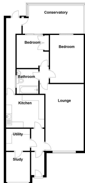
Total area: approx. 94.9 sq. metres (1021.6 sq. feet)