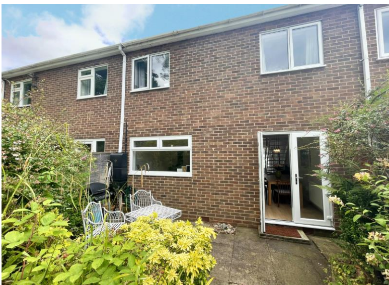
Living/Dining Room Kitchen/Breakfast Room