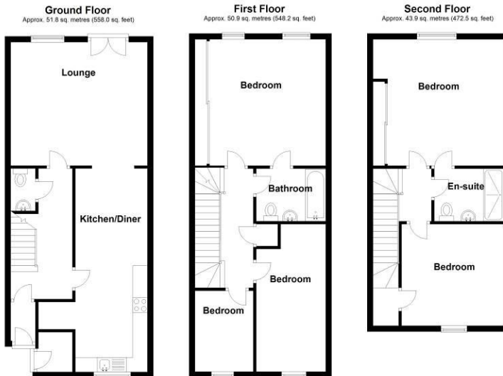
Total area: approx. 146.7 sq. metres (1578.8 sq. feet)

We are advised by the vendor that the property is leasehold with approx. 988 years remaining on the lease, a service charge of approx. £1,965 per annum and a ground rent of approx. £202 per annum but are awaiting confirmation from the vendor's solicitor. We would strongly advise all interested parties to obtain verification through their own solicitor or legal representative. EPC supplied by Vendor. Council Tax Band - E.