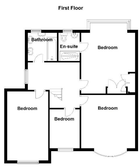
Total area: approx. 175.6 sq. metres (1890.6 sq. feet)